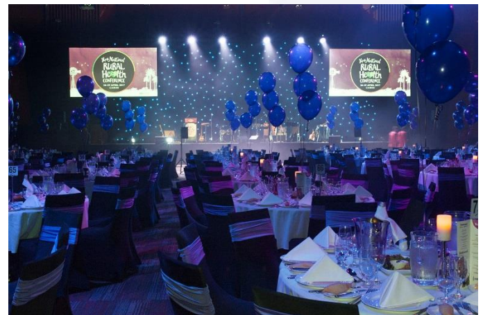
14 th NRHC Conference dinner